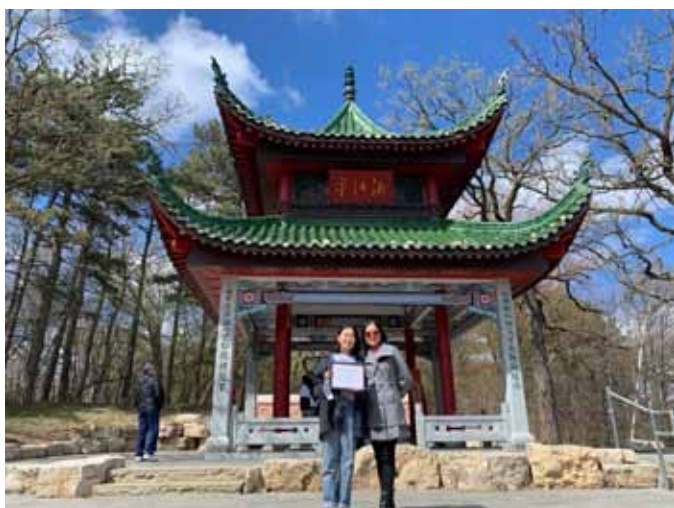
An awardee with her mom in front of Xiangjiang Pavilion